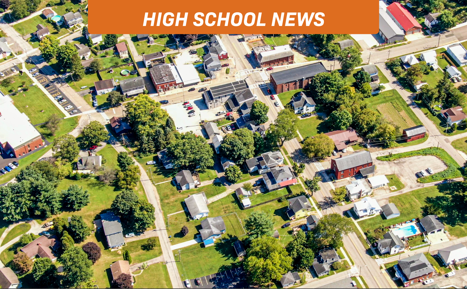
AERIAL VIEW OF LUCAS