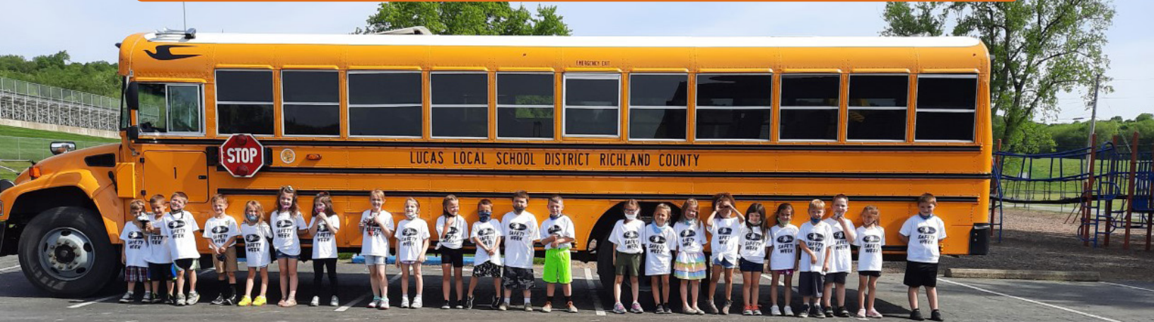
Kindergarteners at the end of their Safety Week in May.